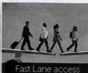
Fast Lane access